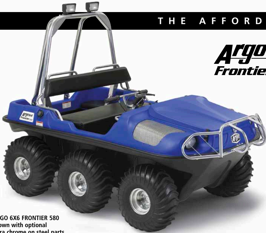
ARGO 6X6 FRONTIER 580 shown with optional ultra chrome on steel parts