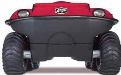
Convenience Group Handlebar steering